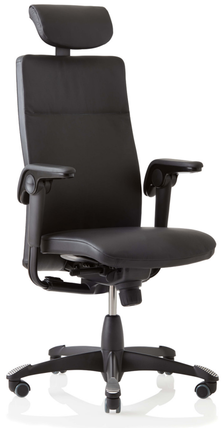
Design: Svein Asbjørnsen/sapDesign®. Patent- and design protected.